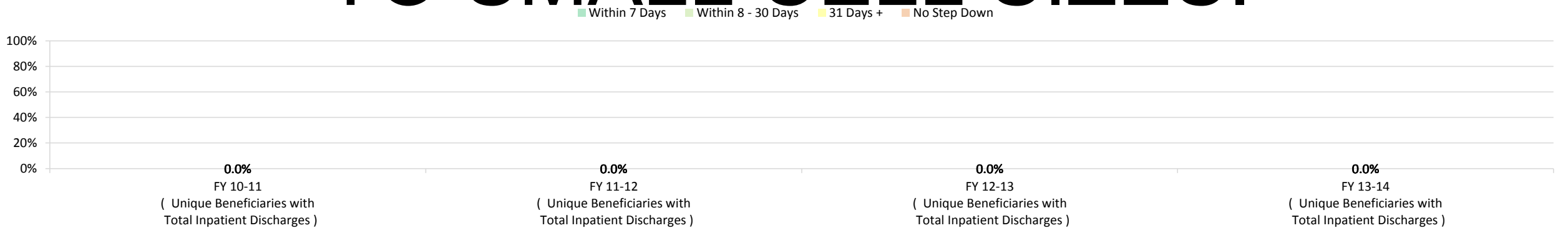
Percentage of Discharges by Time Between Inpatient Discharge and Step Down Service

TABLES AND CHARTS NOT PRODUCED FOR THIS INDICATOR DUE TO SMALL CELL SIZES.