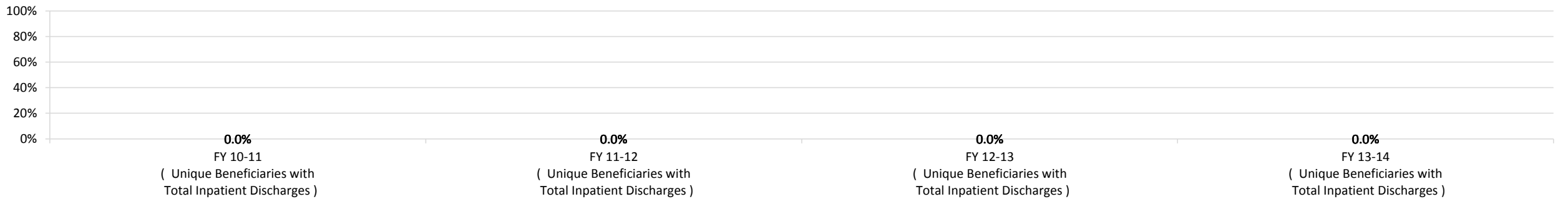
Percentage of Discharges by Time Between Inpatient Discharge and Step Down Service

TABLES AND CHARTS NOT PRODUCED FOR THIS INDICATOR DUE TO SMALL CELL SIZES.