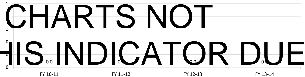
Percentage of Discharges by Time Between Inpatient Discharge and Step Down Service