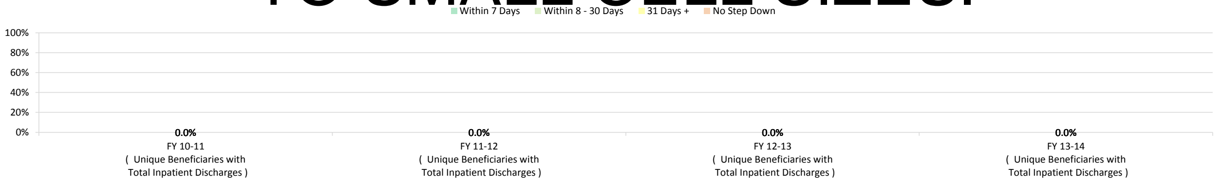
Percentage of Discharges by Time Between Inpatient Discharge and Step Down Service

TABLES AND CHARTS NOT PRODUCED FOR THIS INDICATOR DUE TO SMALL CELL SIZES.