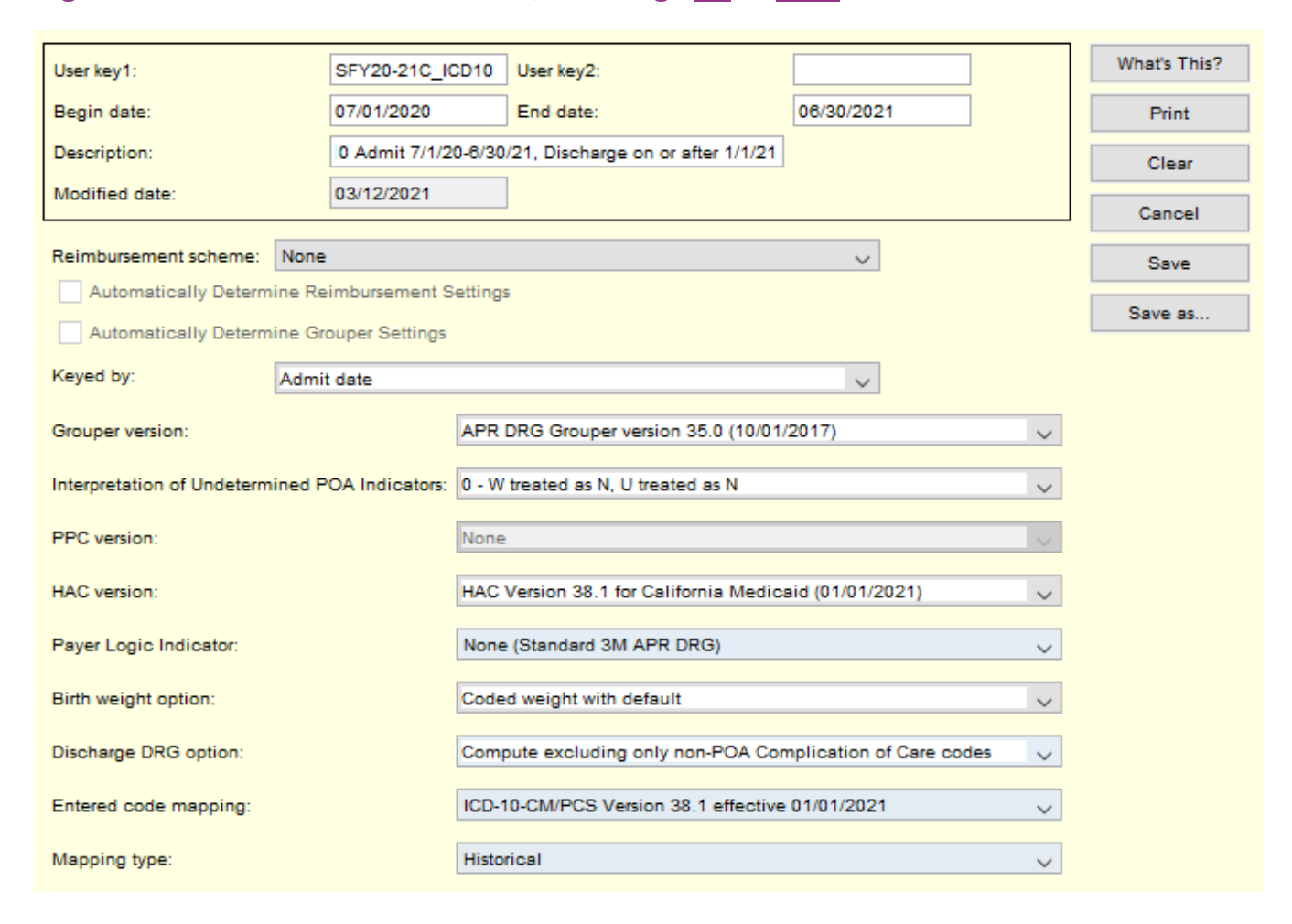
Figure 3: ICD10 admit 7/1/20-6/30/21, discharge on or after 1/1/21